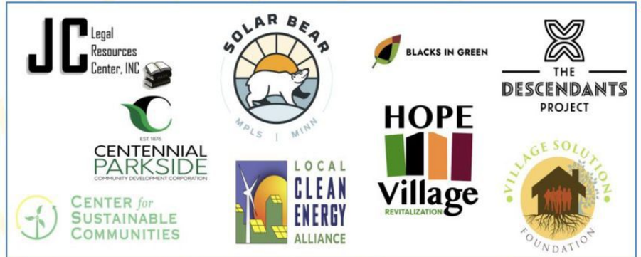
A number of PSEF's community partners in Communities of Color Building Solar Capacity (CBCS).

We're excited to accept this challenge – stepping into the new year with additional hiring and contractual services to meet the varied needs of our growing membership, and ready to provide broader, open-source sharing of critically needed field knowledge. Of particular concern is ensuring the field's readiness for accessing those billions of dollars pending from the Biden Administration - either directly or via the many state and local intermediaries through which the funds will flow.